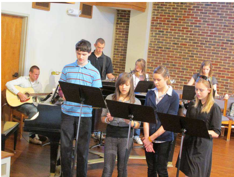
Some of the Sr. Youth helped led worship on November 18 th .