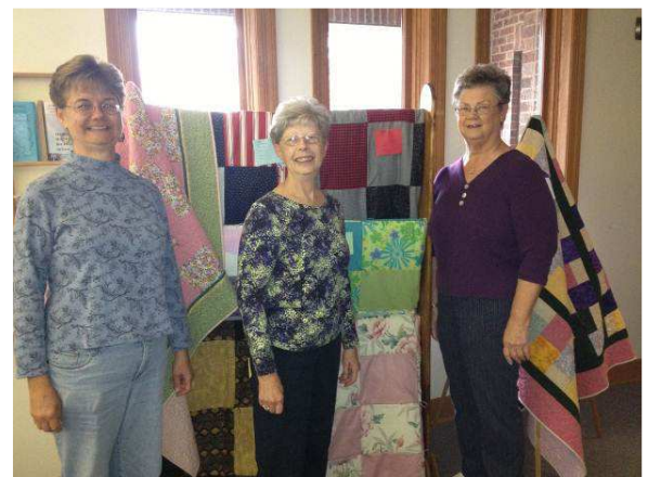
The Comforters say "THANK YOU" to all who participated in the Quilt Auction to benefit LWR