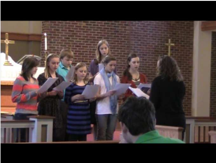
On November 4 th The Youth Choir (grades 7 th through 12 th ) sang, "Arise and Shine Forth".