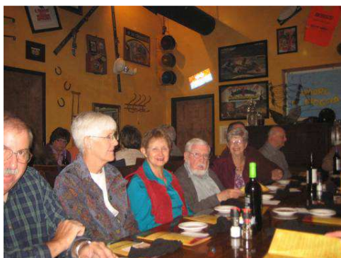
A few of the OWLS (Older Wiser Lutherans) group at an outing at Terranova's restaurant.