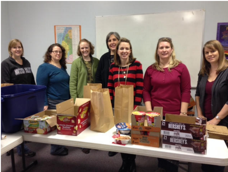
The Mom's Bible Study group packed up lunches for the Weekend Lunch Food Program for Liberty Middle School.