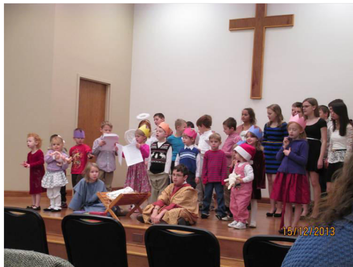
The Sunday School children presented "The Christmas Story" in-between services on December 15 th .