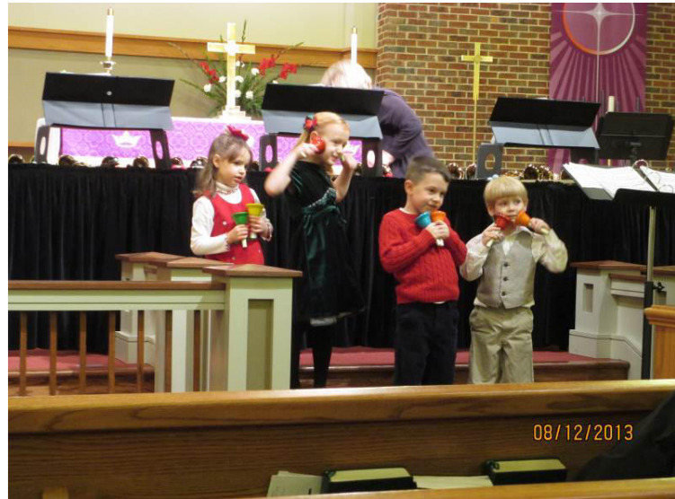
The Cherub Choir was one of the many groups that performed at this year's "Ring & Sing" on December 8 th .