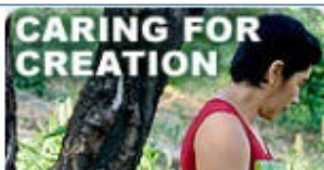
CARING FOR CREATION Help care for God's creation