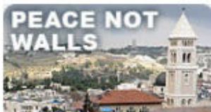
PEACE NOT WALLS Learn, pray, and act for peace with justice in the Holy Land