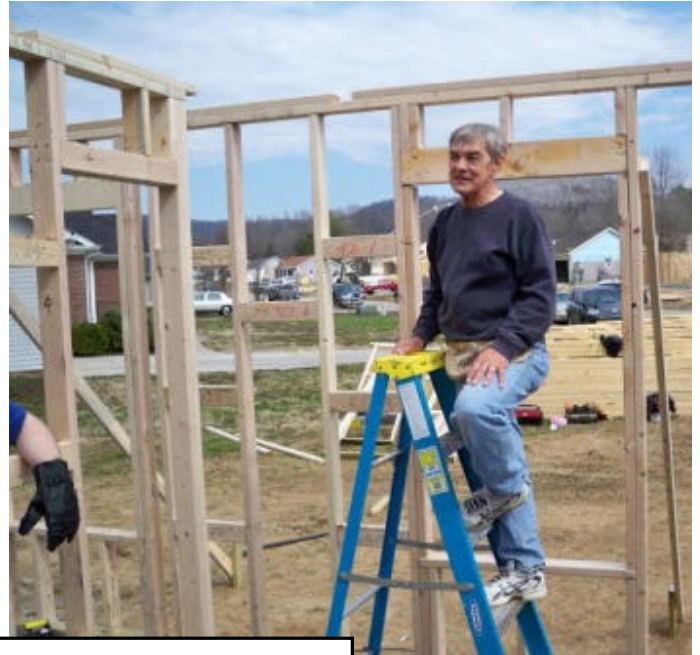
“God’s People Reaching Out”