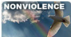
NONVIOLENCE Build a culture of peace and nonviolence