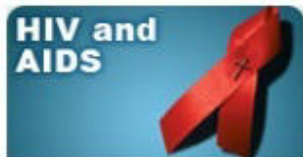
HIV and AIDS Respond faithfully and effectively to this pandemic