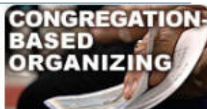
CONGREGATION-BASED ORGANIZING Seek justice through your congregation