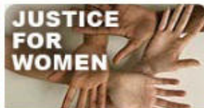
JUSTICE FOR WOMEN Change society and church in a patriarchal culture