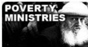
POVERTY MINISTRIES Walk with people who are poor and oppressed