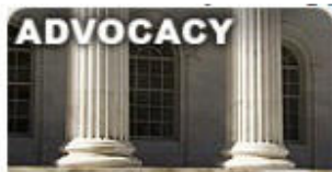
ADVOCACY Speak with and on behalf of others in need

Find out more at http://www.elca.org/Our-Faith-In-Action/Justice.aspx