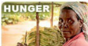
HUNGER Address the root causes of hunger and poverty