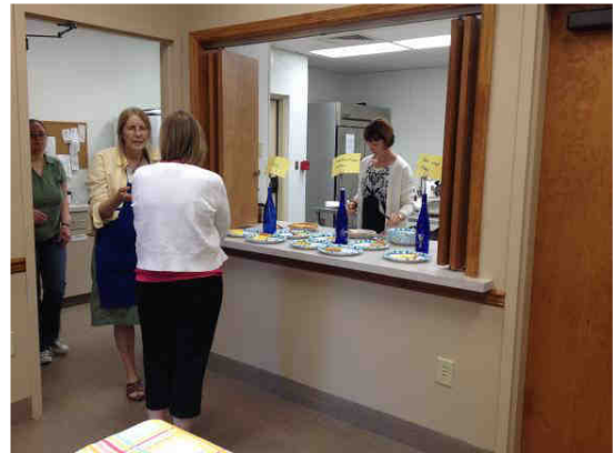
A Mother's Day Brunch on May 12 th with fruit crepes and a variety of quiches.