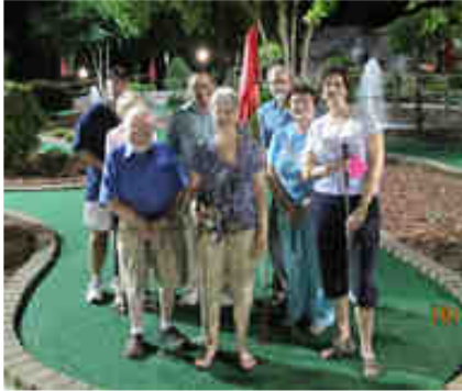
OWLS playing miniature golf on May 18 th .