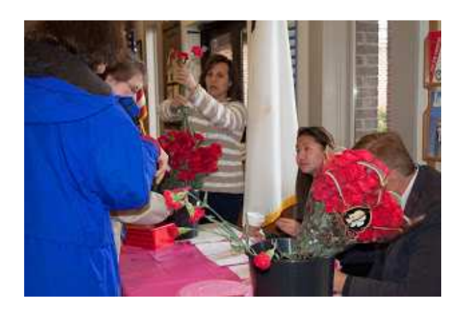
The Youth organized carnations for Valentine's Day