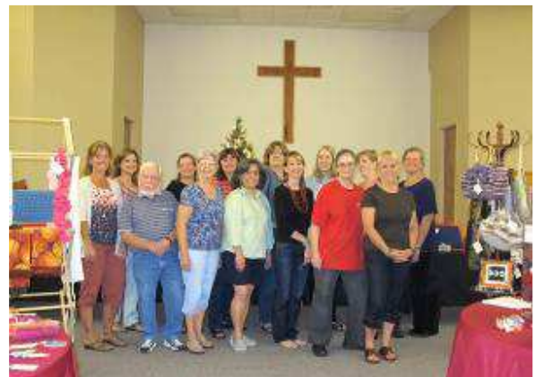
Hand Made Market 2012 volunteers and artists