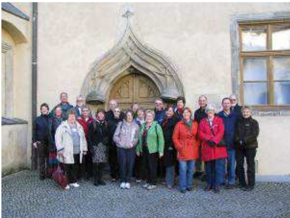
The group who traveled to Germany pictured in front of Katie's Portal of the Luther House in Wittenberg.