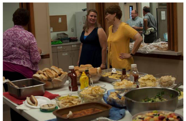
Member Potluck Luncheon