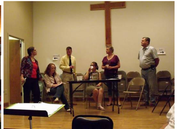
The Repertoire Players in the summer's dinner theatre performance of "The Unexpected Visitors".