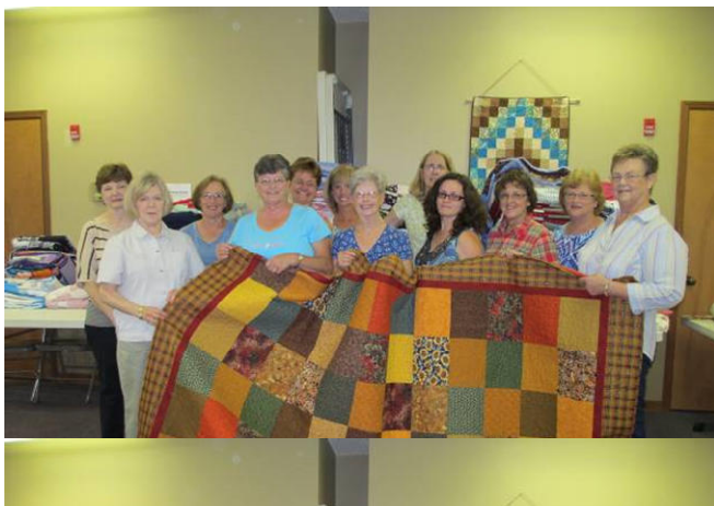
The Comforters with one of the 138 quilts made this year.