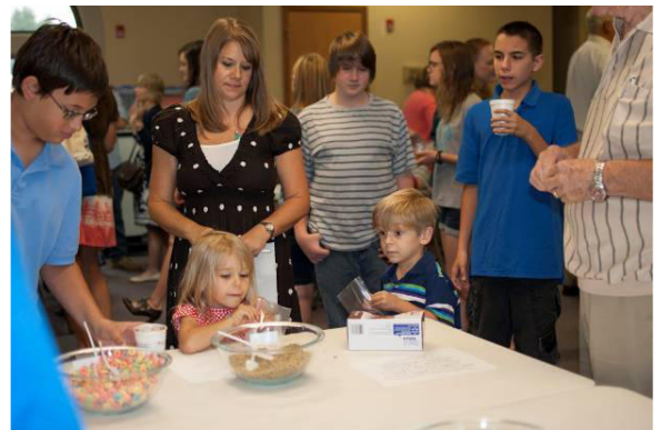
Sunday School Rally Day