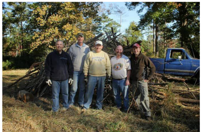
The Men's Retreat at Lutheranch was held October 24-26. Nine members attended with the theme "Fish, Work and Explore".