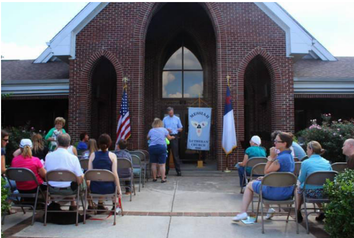
On October 5 th the church had a blessing of the animals service with 26 animals and their owners present.