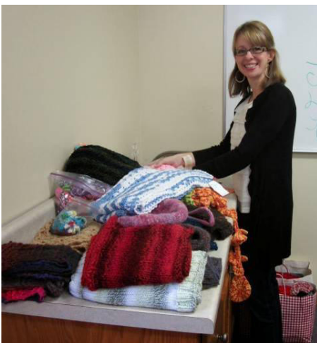
The Handmade Market to benefit Lunches4Learning was on the last weekend of October. It was a record year for items donated as well as money raised – over $5,000!