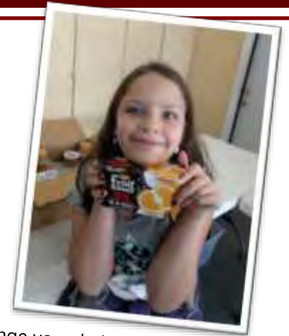
"Orange you glad you came?" youth at House of Harvest service day on October 21st.