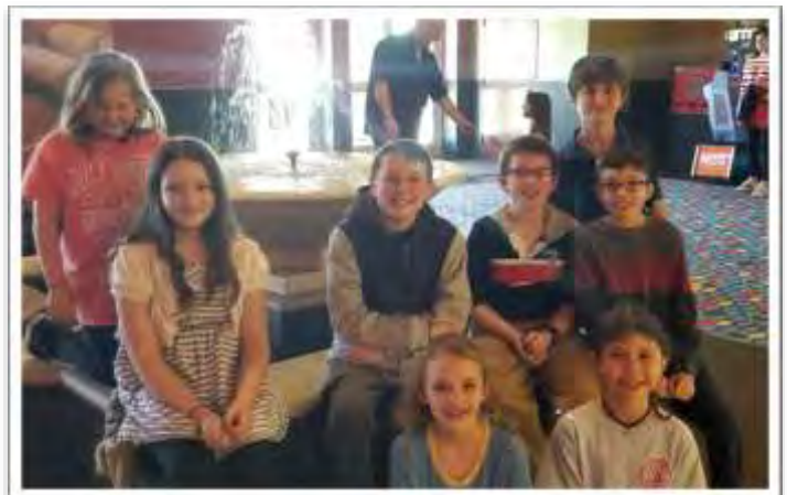
MOES go to the Movies! The group enjoyed the movie, "How to Train Your Dragon 3" on Feb 23.

We will make lunch together in the Parish Hall kitchen with a short devotion and then games in the Parish Hall. Join us as we gather together in fellowship.