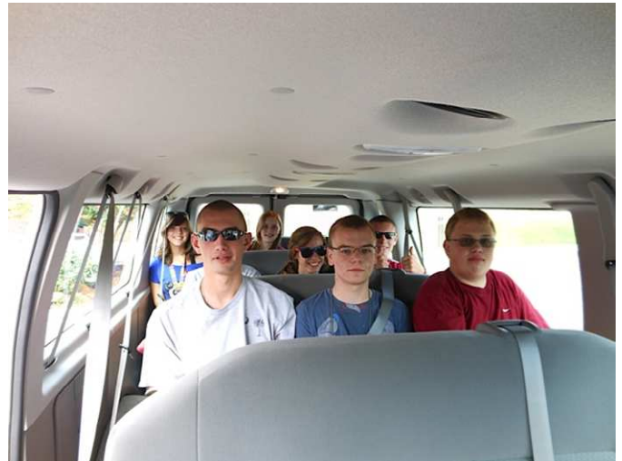
The Senior Youth on way out of town for National Youth Gathering in New Orleans