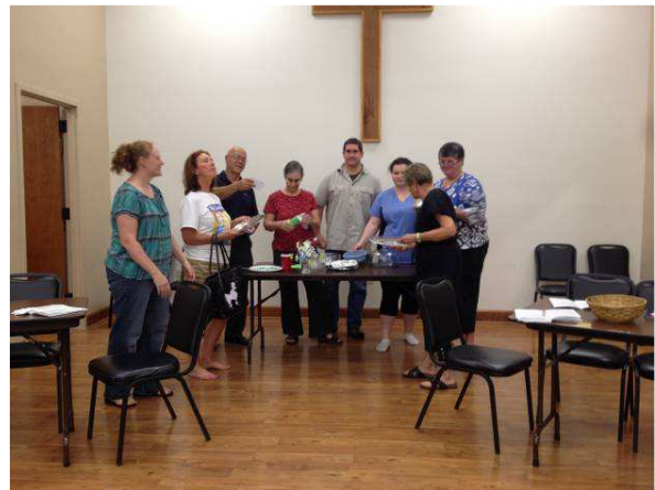
Dinner Theatre rehearsals for "A Wing and a Prayer"