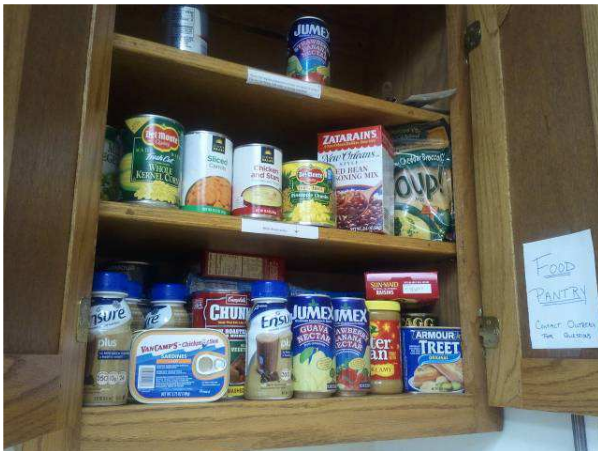
Members have been very generous with food pantry gifts, which are much appreciated!