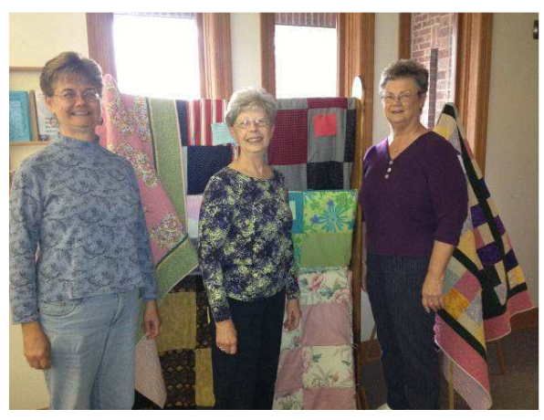
The Comforters say "THANK YOU" to all who participated in the Quilt Auction to benefit LWR