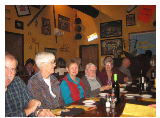
A few of the OWLS (Older Wiser Lutherans) group at an outing at Terranova's restaurant.