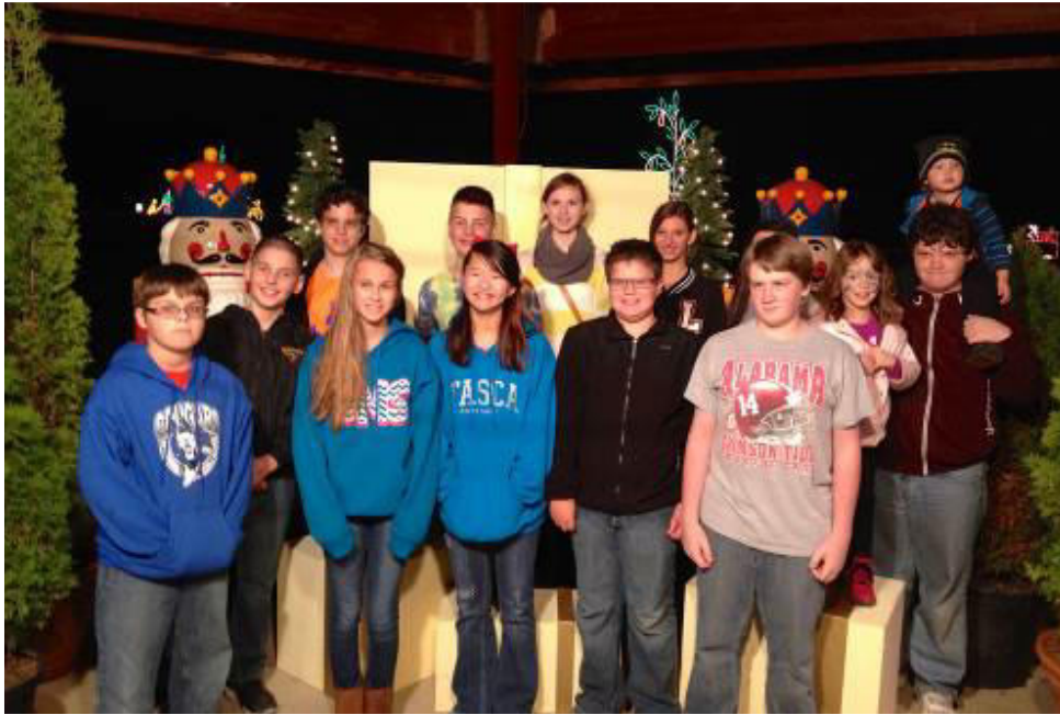
Jr. Youth at the Galaxy of Lights