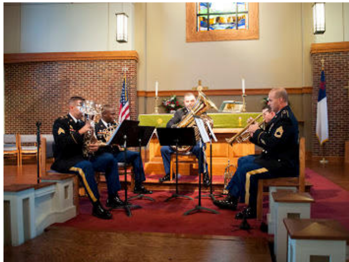
The Arsenal Brass Quintet played at our Inaugural Music at Messiah Concert on November 10 th .