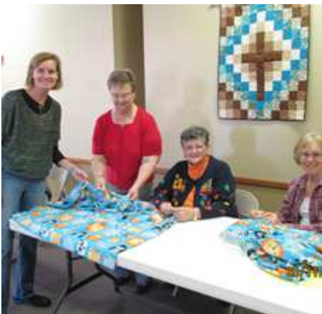
The Comforter tied fleece blankets which will be included with the gifts given to the 'Christmas Angel' children selected by the Salvation Army