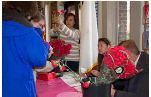
The Youth organized carnations for Valentine's Day