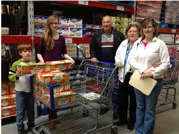
Weekend Food program pictures from March 28