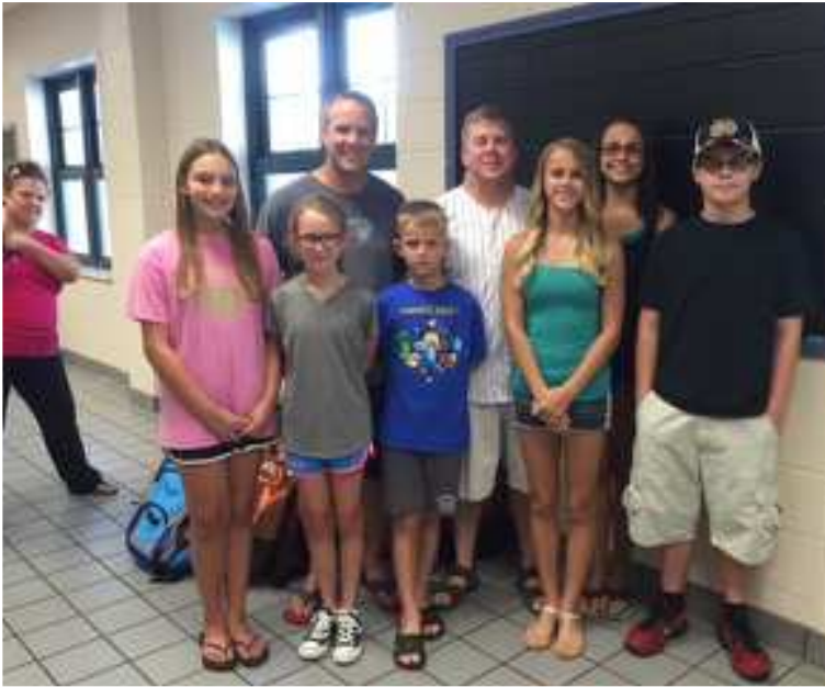
SS Kids Team packing school bags at Rainbow Elementary