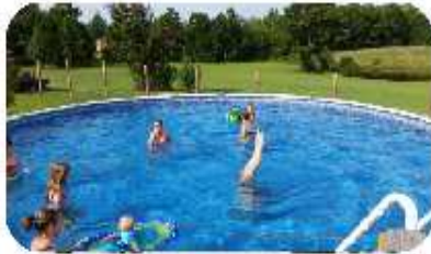
POOL PARTY AT THE RYAN'S WAS A SPLASH!