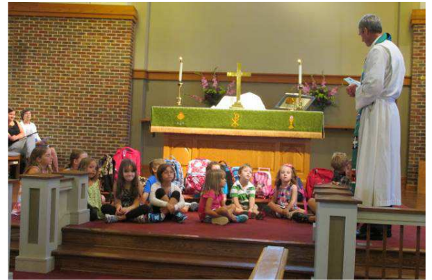
The annual Blessing of the Backpacks

Sunday School Rally Day introduced the children to their new Sunday School classes. A Hot Dog Luncheon followed with specialty hot dogs grilled for the occasion.