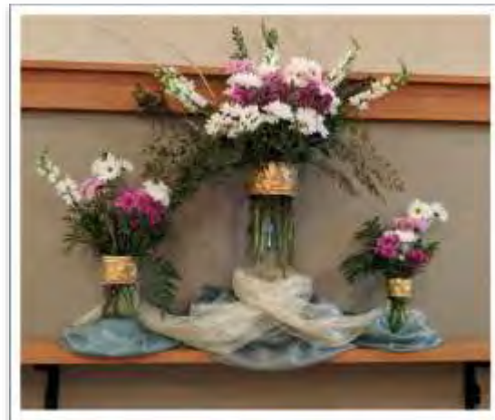
The sign up board for Sunday Altar Flowers is located in the Narthex. The cost is $25 per household. Easter Flower forms will begin March 4th.