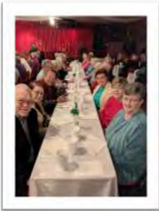
Left: Messiah's Older Wiser Lutherans (OWLs) enjoyed a lunch on March 15th at Yesteryear's Event center in Athens.

THE 90'S CALLED --- They want you to submit an updated family photo for the upcoming Messiah Photo Directory!