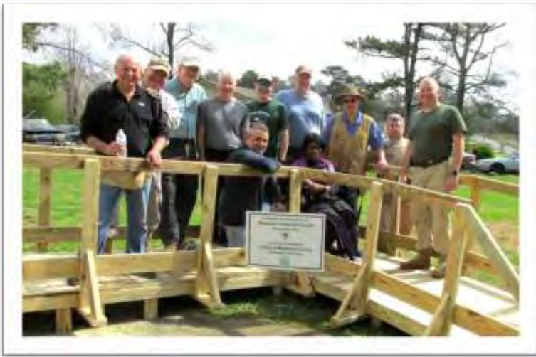
Above: MLC's Wheelchair Ramp Team built their 30th ramp on March 17th. Check out the MLC blog

This area intentionally left blank (Redacted)