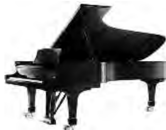
Piano Dedication June 10, 2018 - 4 p.m.

MAY 20 2018 4:00 PM Free Admission Public Invited Music at Messiah Concert (Admission Free) Messiah Lutheran Church 1710 HWY 17 N • WINTER, FL messiahmessenger.org Financial support of the church is essential for ministry. Sponsorships available.