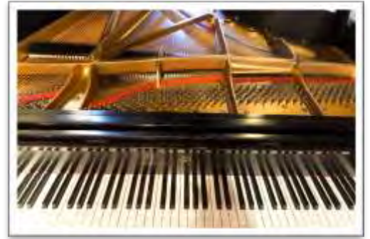
View of keys and interior of the Steinway D.