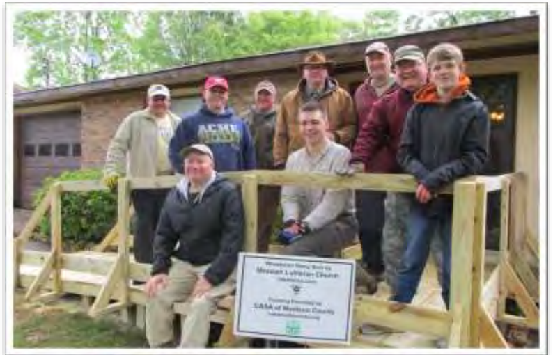
CASA Ramp Build Number 36 was completed on Saturday, April 20th. Read more about the build on mlutheran.org