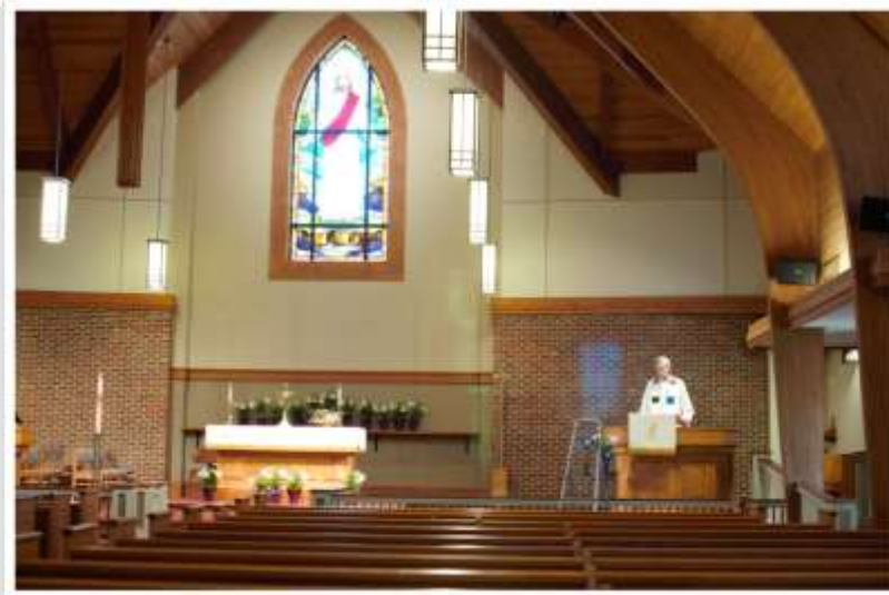
Easter Service of Worship 2020 in person attendance was 7, online attendance was 404 views!