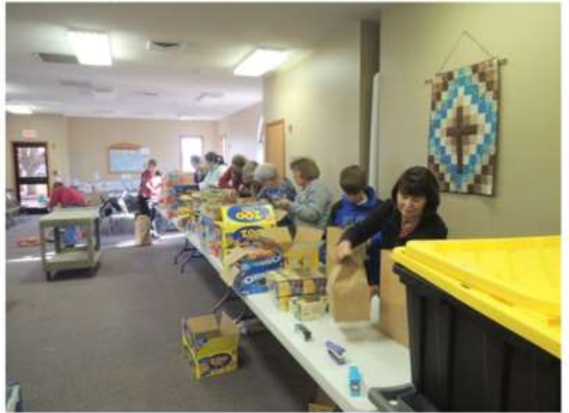
MLC Youth and Volunteers Pack Weekend Food Bags (Photo taken in 2018)

God has so blessed us at Messiah. To share what He has entrusted to us to support the Weekend Food Program ministry serves to spread the Word of God and his love for us all.