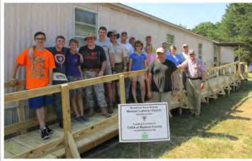
Ramp (left) MLC's Wheelchair Ramp Team poses on their Oct. 5 project – an unusually long ramp built on an unseasonably hot day! Council Retreat (below) Oct. 17-19