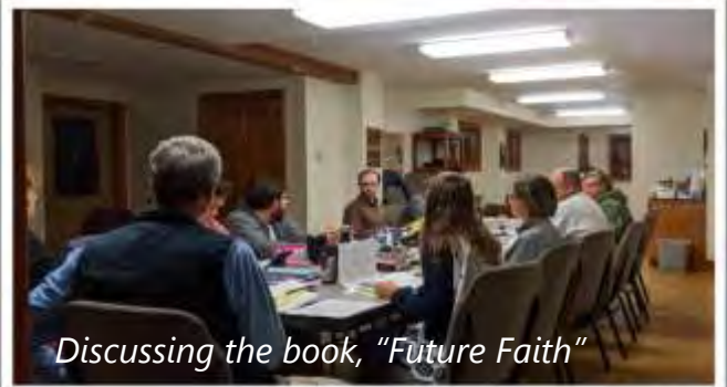
Discussing the book, "Future Faith"