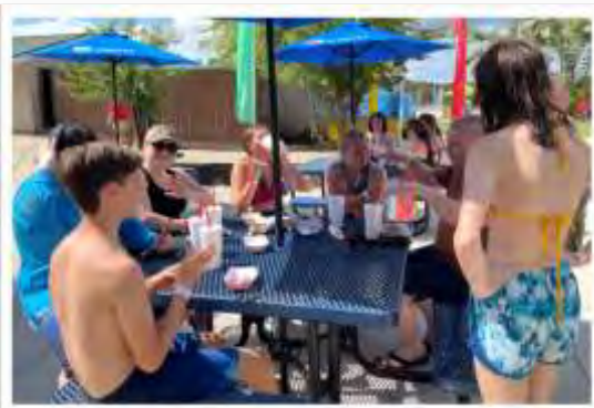
Left: MLC Youth had a great time at Point Mallard Waterpark on June 22. The next summer youth gathering is an escape room on July 22. Time TBA