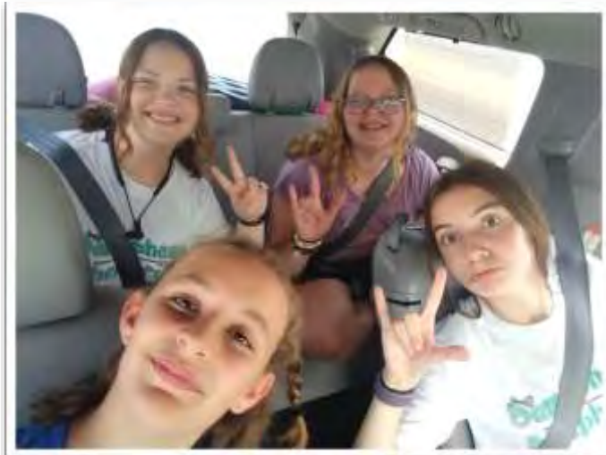
Above: Affirm participants sharing a light moment.