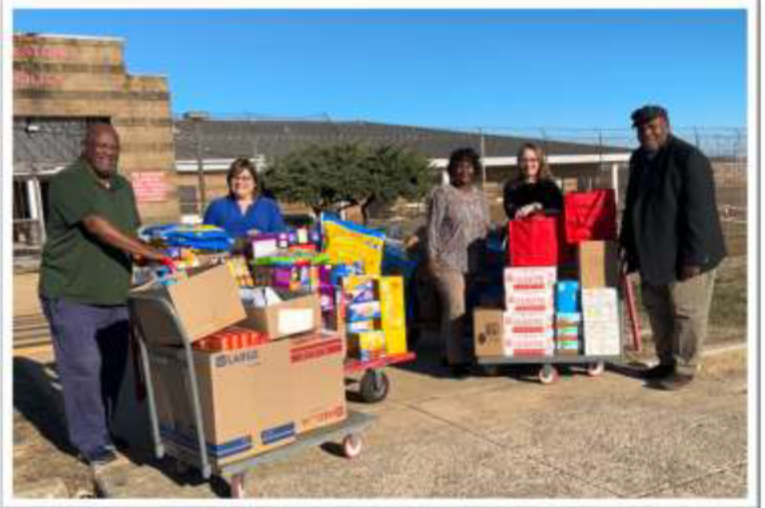
Above: Donations being delivered to the Limestone Correctional Facility.