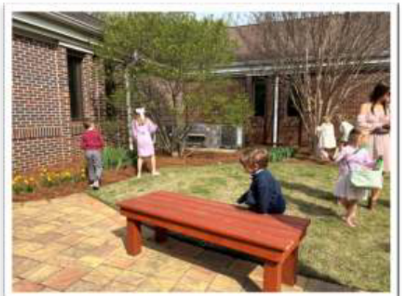
Messiah Youngsters and their parents hunting for eggs on March 24