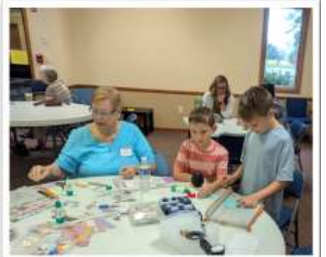
Above: As an effort to spur service and fellowship during the summer worship schedule, the following group activities took place after the single 9:30 a.m. worship (L-R) LWR School Kit Packing on July 14, Bunco on July 21, and on July 28, an Artreach Craft Project. (M. Kilby)