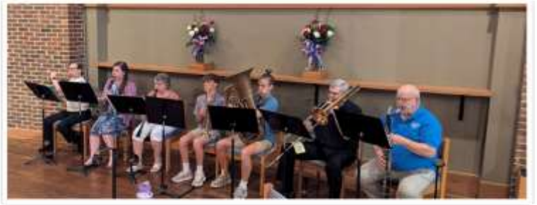
Above: MLC's Instrumental Ensemble accompanied worship on July 7. They are hard to see but wonderful to hear!